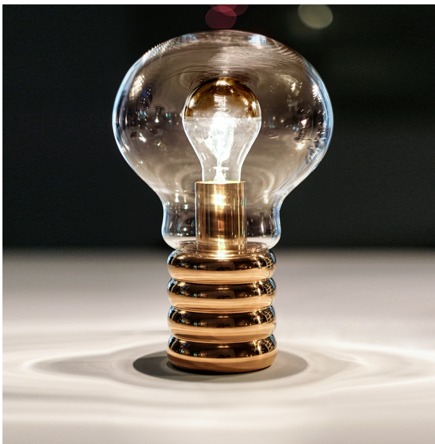
Bulb Brass INGO MAURER TEAM 2021

Brass base, mouth blown Murano crystal glass. Bulb Brass is a member of the Ingo Maurer Bulb family. Based on the world-famous 1966 design, the Ingo Maurer team developed a brass version. The handcrafted lamp base is made of high quality brass. The untreated brass surface tends to change over time, giving it a special character. A patina is created, a surface created by natural aging. Patina is the result of daily use and is perceived as an aesthetic gain, as it stands for a characteristic material property that can ultimately be understood as the individual signature of the user.